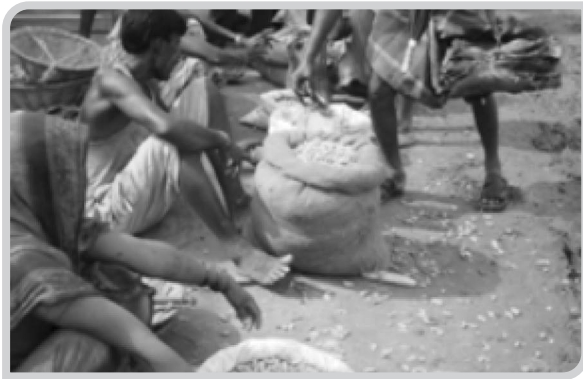
कृषि सूचना तथा संचार केन्द्र