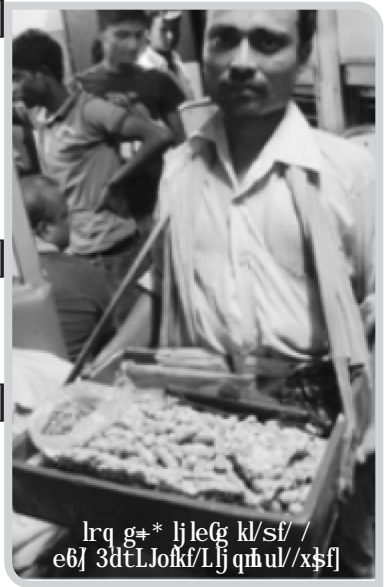
कृषि सूचना तथा संचार केन्द्र